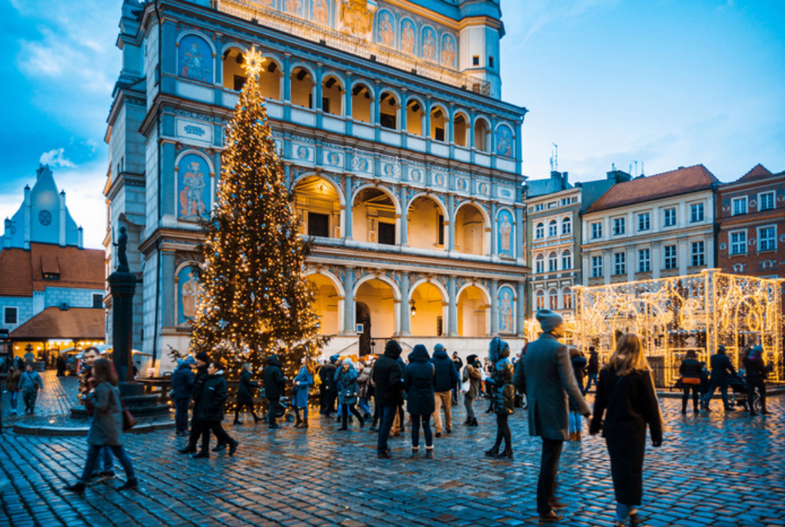
POZNAN, POLAND - Graben Christmas Street Market