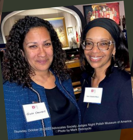
Thursday, October 20, 2022 Advocates Society Judges Night Polish Museum of America