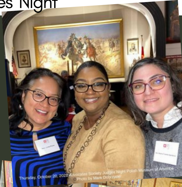
Thursday, October 20, 2022 Advocates Society Judges Night Polish Museum of America