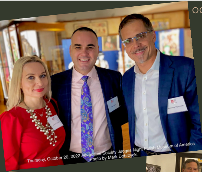
Thursday, October 20, 2022 Advocates Society Judges Night Polish Museum of America