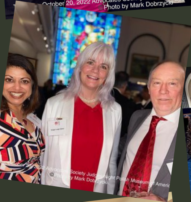
October 20, 2022 Advocates Society Judges Night Polish Museum of America