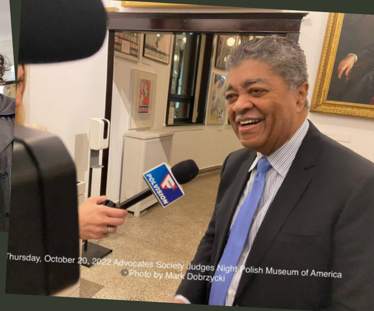
Thursday, October 20, 2022 Advocates Society Judges Night Polish Museum of America