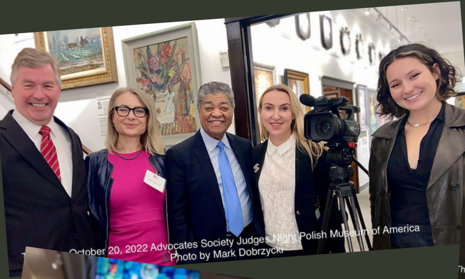
October 20, 2022 Advocates Society Judges Night Polish Museum of America