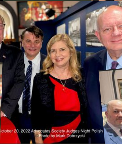
October 20, 2022 Advocates Society Judges Night Polish